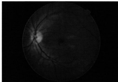
Normal retinal photograph